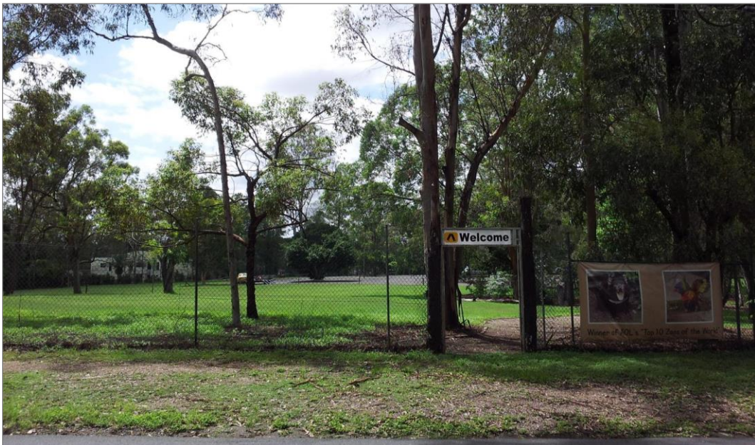
Figure 2 – The proposed site for the day care centre – to the left of Lone Pine Koala Sanctuary's main entrance (Wilson, design brief).