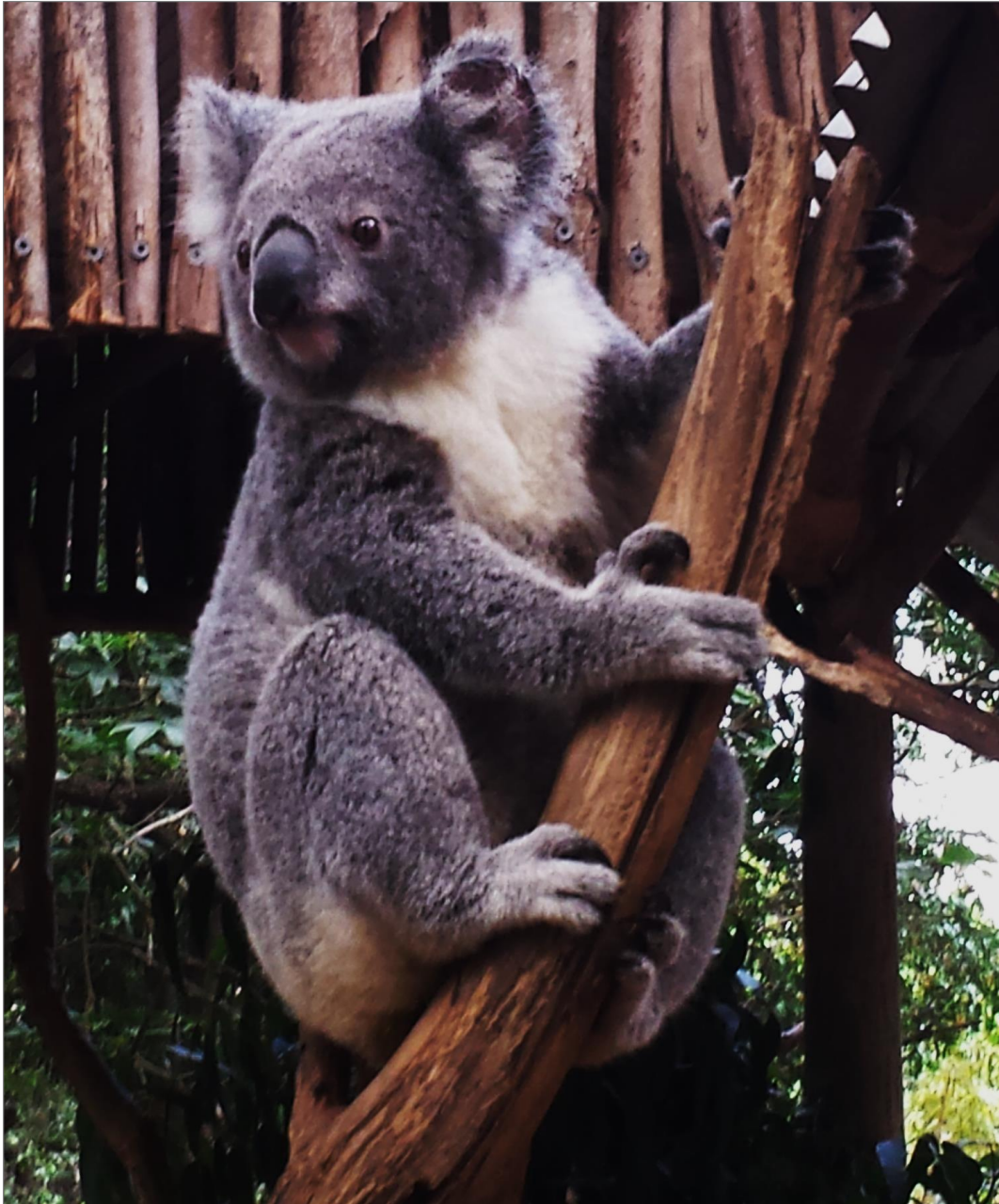
Figure 1 – A koala in the Lone Pine Sanctuary (photo by Auður Gróa Valdimarsdóttir, 2014).

the spirit of sustainable education. The main aims of SE are to develop understandings of what it means, individually and as a global society, to respect, develop and use both natural and human made environments wisely, protect human rights, nurture multiculturalism, and take responsibility for actions that affect natural and human wellbeing, both now and into the future (Macdonald, 2009).